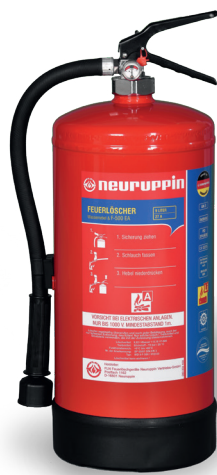
Stored pressure extinguisher WD 9 F-500 (MED approved)