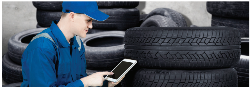
Manufacturing, processing, and storage of rubber, including tyres