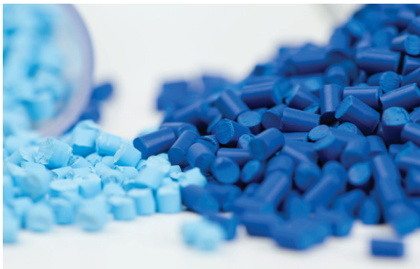
Plastic and foil processing