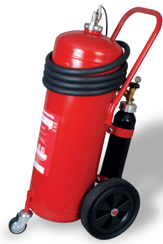
Wheeled extinguisher WA 50 F-500

Comprehensive testing was conducted on an E-scooter 182-cell battery (cell type 18650), a larger battery size than those generally used in devices such as mobile phones, laptops, power tools, gardening tools, model sports (e.g., remote-controlled cars, boats, drones), and E-bicycles (which can use 48-cell batteries). Neuruppin created two different portable 9L extinguisher models for lithium-ion batteries up to the tested battery type with 1890 Wh (51.1 V / 37 Ah).