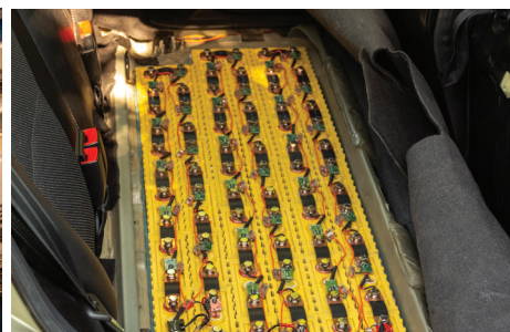
Large and/or unattended battery storage areas