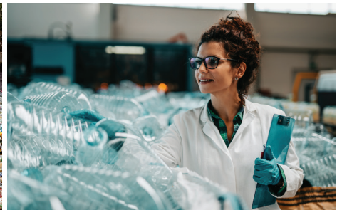
Manufacturing, processing, storage, and warehousing of plastics. F-500 also protects small load carriers