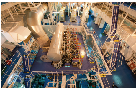
Propulsion batteries/ engine room