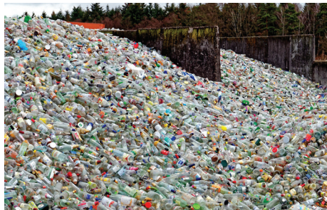
Mixed waste (disposal and recycling)