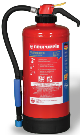
Cartridge-operated extinguisher WA 9 F-500