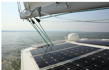
Solar storage on yachts and ships