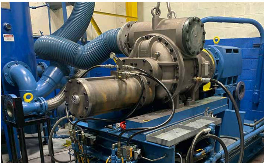
A new SGC233L compressor on one of the three Mechanical Run Test stands at FRICK® Industrial Refrigeration. The SGC233L compressor is used on the RWFII-222 screw compressor package.